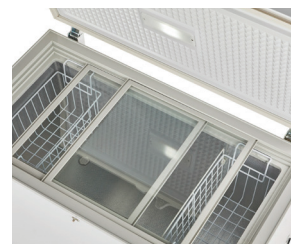
Lid and dual glass sliders, 2 wire baskets