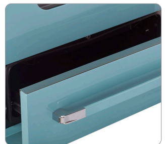
Large storage drawer