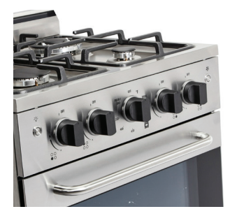
Modern knobs designed for cooktop & oven