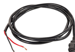
8ft electrical wire cut end included