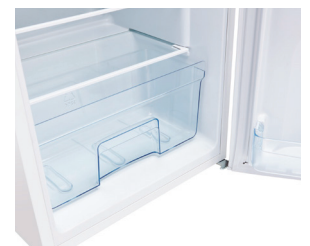
4 glass shelves 1 crisper drawer