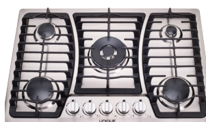
Italian-made "Sabaf" burners