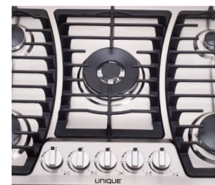
Dual ignition (electrical/battery)