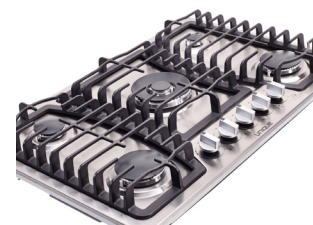
Stainless steel construction