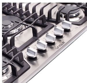
Modern styled knobs