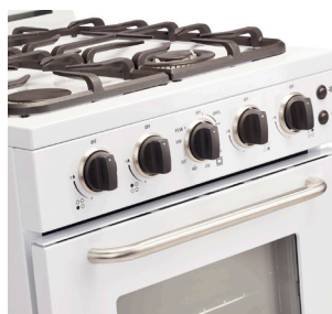
Modern knobs designed for cooktop & oven