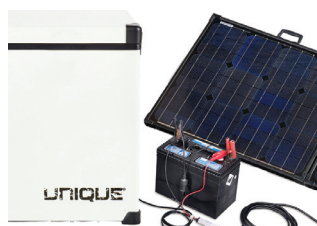
Solar panel & battery sold separately