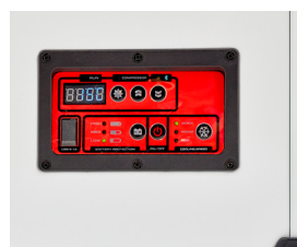
Digital control panel with 1 USB port - 5V 2.1A, etc.